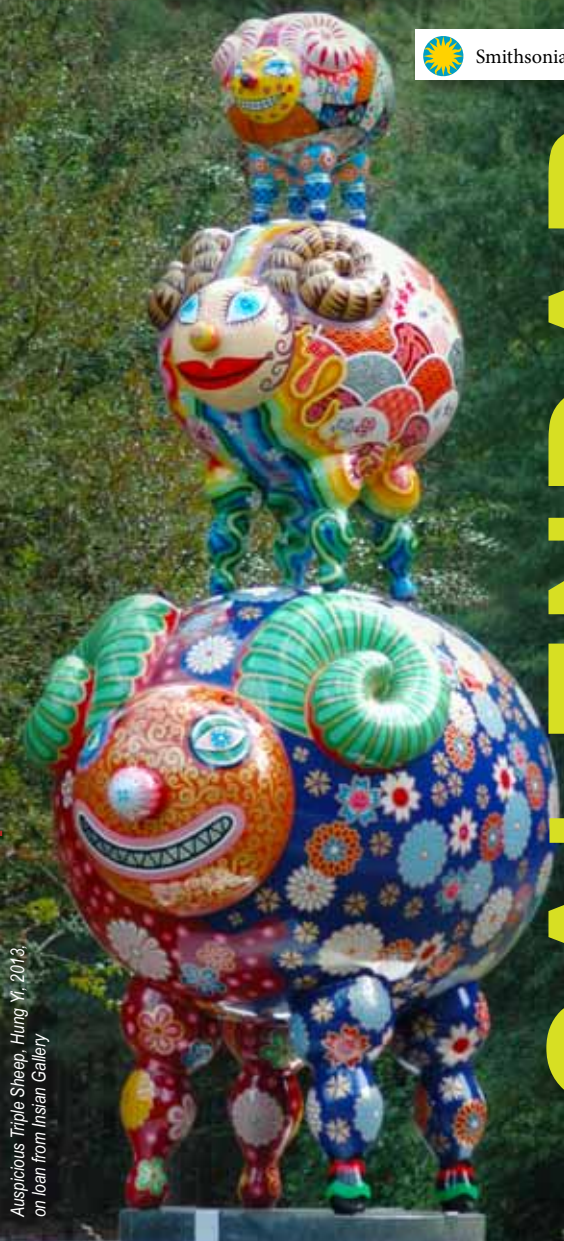
Auspicious Triple Sheep, Hung Yr. 2013, on loan from Instan Gallery